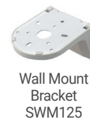
Wall Mount Bracket SWM125