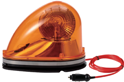
SKMP / SKMPH

Revolving warning lights with detachable rubber magnet for emergency response vehicles